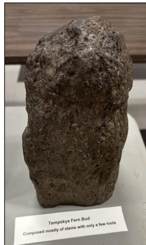
Tempskya Fern Bud Composed mostly of stems with only a few roots