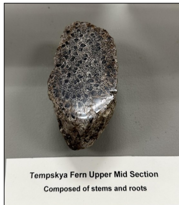
Tempskya Fern Upper Mid Section Composed of stems and roots