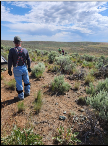
Thanks for posting photos on our Facebook page! When you attend field trips, make sure to share your photos with us!