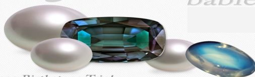
June Birthstone Trio! Those born in the month of June have three very unique and exquisite gems as their birthstone; Pearl, Alexandrite and Moonstone