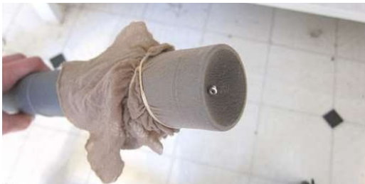
PUT A STOCKING OVER THE END OF A VACUUM TO FIND TINY ITEMS LIKE EARRINGS